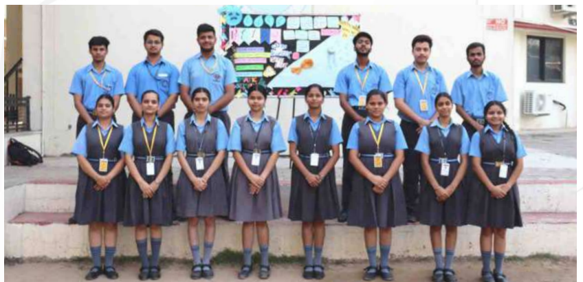
Thematic assembly on Life below water (XII Sc.-B)