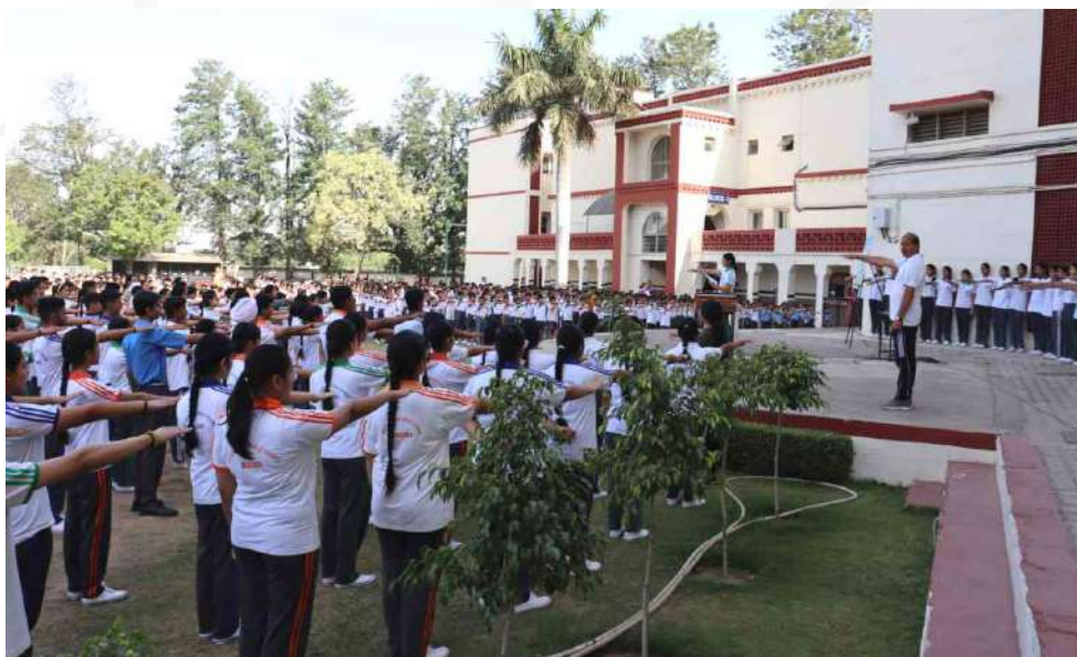
Pledge taken on water conservation