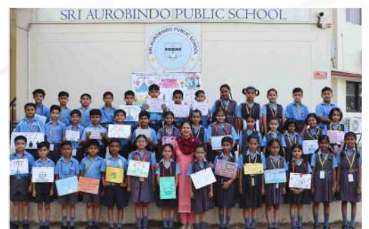
Thematic Assembly of (II-A) on Gender Equality