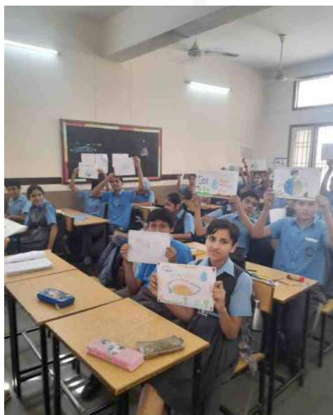
Poster making activity on water conservation