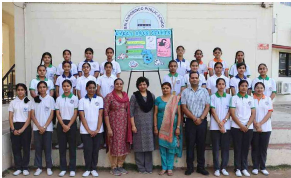
Deptt. of science conducted water conservation activity

In order to spread a word for water conservation in the students of classes VIII-XII the school organized an event on awareness for saving water on May 3&4 under which about 82 students of classes VIII participated for poster making competition on water conservation. Students of class X also organized an assembly on the theme water conservation. In which students were enlightened about the importance of water conservation through, speech, self-composed poems, group song. At the end the students also took a pledge to conserve water.