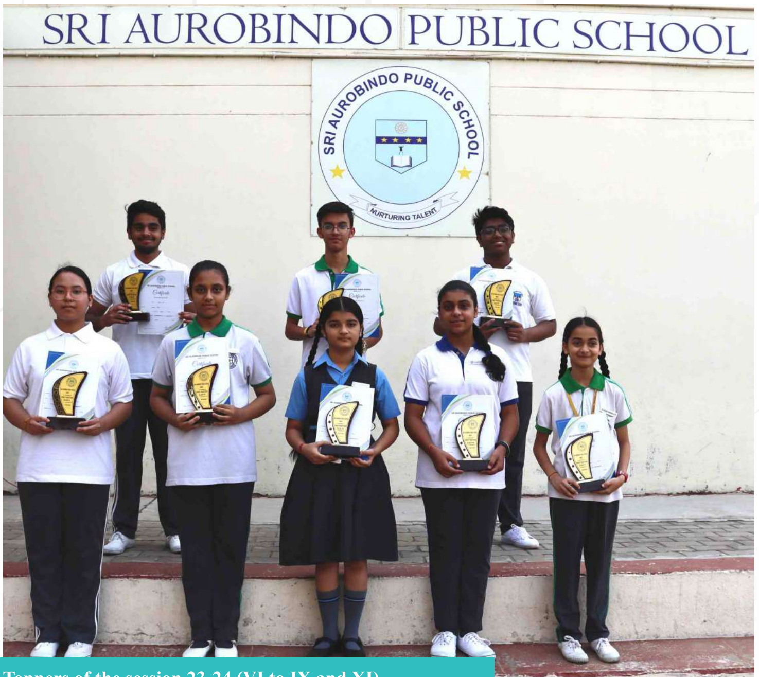
Toppers of the session 23-24 (VI to IX and XI)

The annual tradition of recognizing and awarding academic excellence continues to flourish at school. On May 8, the school held its prestigious ceremony to honor the toppers across various classes in previous session 23-24. The event not only celebrated the achievements of these exceptional students but also served as inspiration for their peers to strive for excellence. The school reaffirms its dedication to nurturing future leaders and scholars, inspiring them to reach new heights of excellence in all their endeavors. The Principal gave away the trophies and certificates to the toppers.