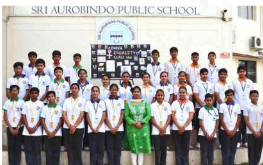
Thematic Assembly of (IX-A) on Gender equality