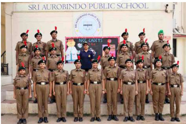
Thematic assembly by NCC Cadets on First Aid