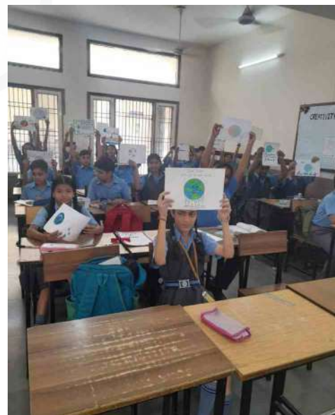
Poster making on water conservation