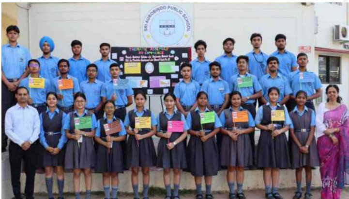
Thematic assembly class (XII) on decent work and economic growth