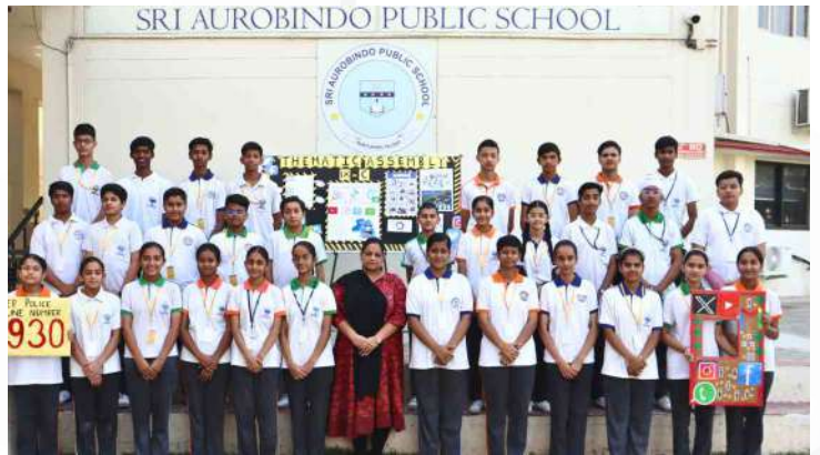
Thematic assembly of (IX-C) on cyber safety and security