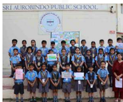
Thematic assembly of (II-B) on Life below water