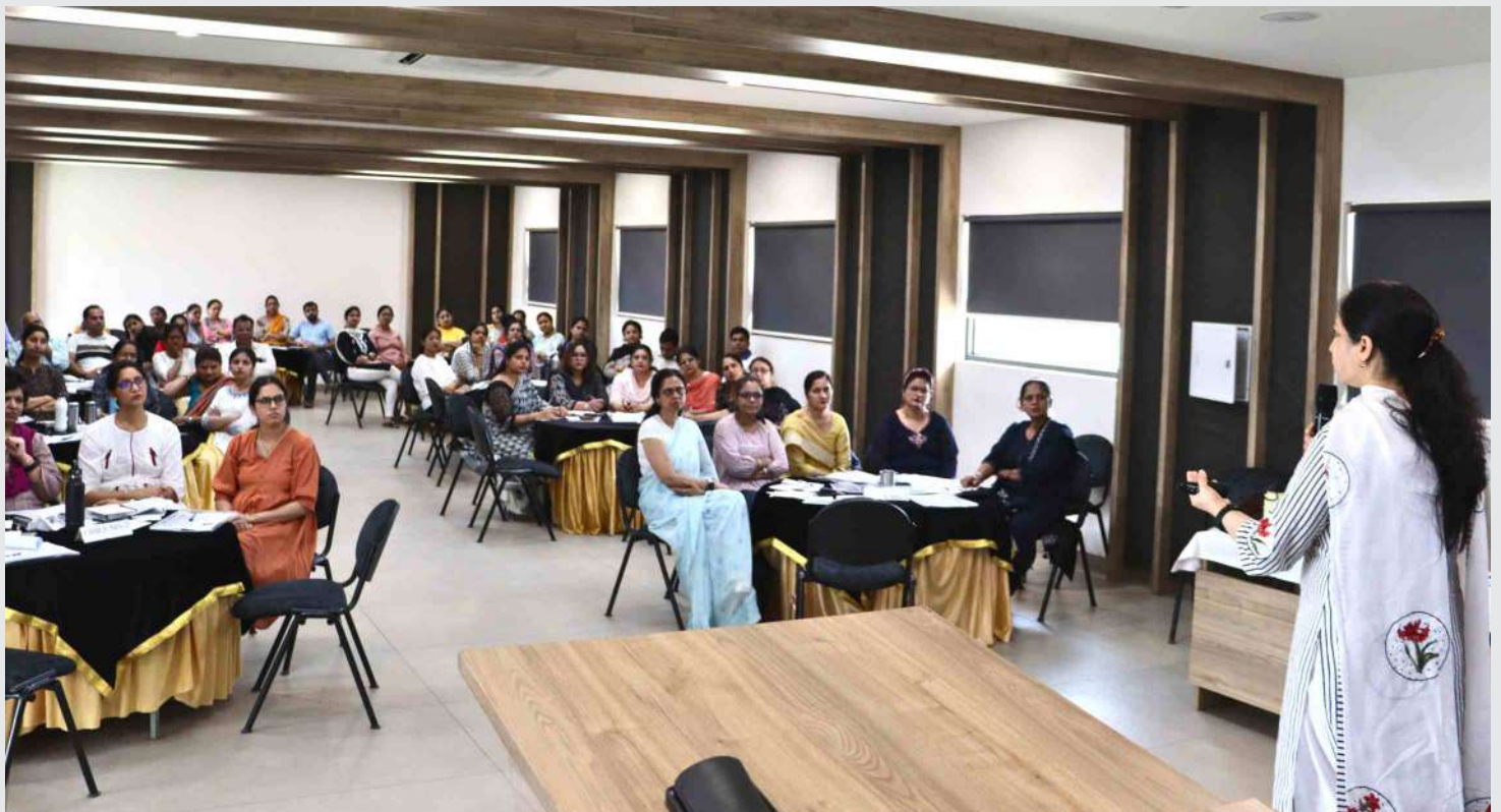
Teachers in Workshop